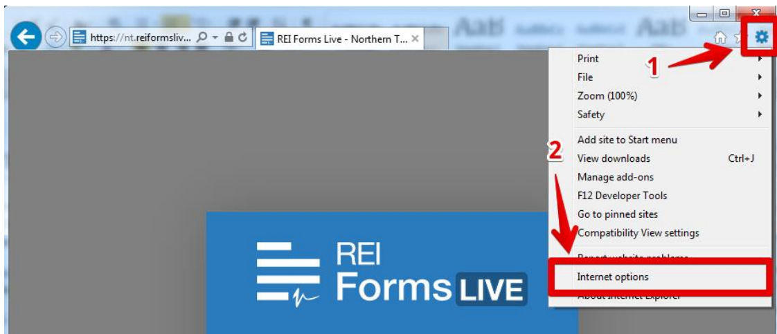
Figure 1 – Internet Explorer Menu